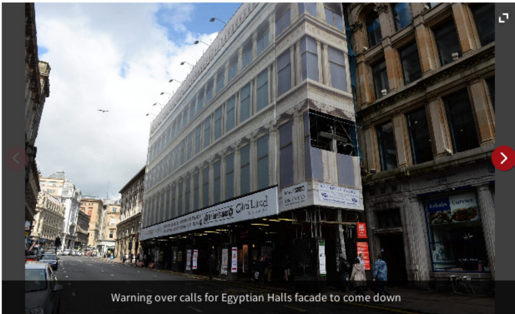
Warning over calls for Egyptian Halls facade to come down